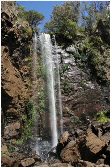
Queen Mary Falls - Queensland